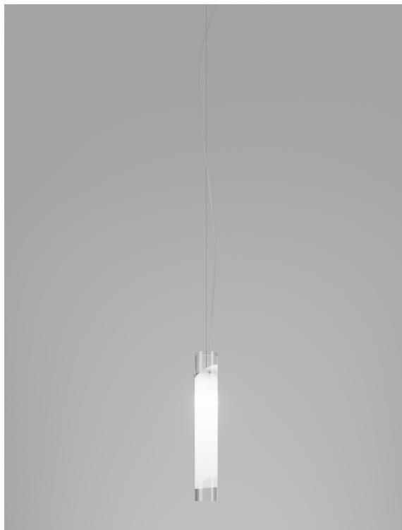
LIO SP CRBC NI E27 CE